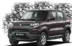
Metallic Granite Gray (ZTN)