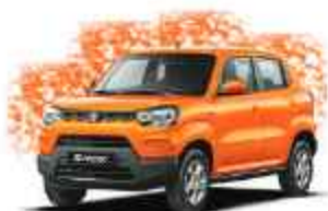
NEW Sizzle Orange (ZZT)

A new color has been introduced for the New S-PRESSO that perfectly captures its robust and preppy characteristics, and further emphasizes the bold and exciting impression