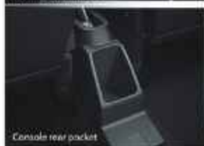
Console rear pocket