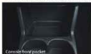
Console front pocket

The S-PRESSO is chockfull of storage options for greater convenience.