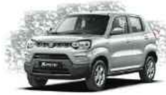
Metallic Silky Silver (Z2S)