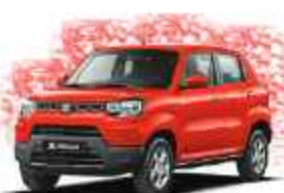
Fire Red (Z4Q)