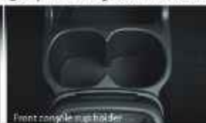
Front console cup holder